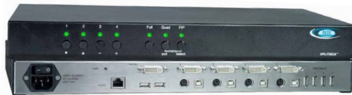
SPLITMUX-DVI-4 (Front & Back)

The SPLITMUX® DVI/VGA Quad Screen Multiviewer allows you to simultaneously display video from four different computers on a single monitor. Additionally, it can switch one of the four attached computers to a shared keyboard and mouse for operation and to four additional USB devices.